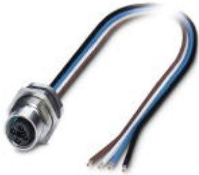
Sensor/actuator flush-type plug, 4-pos., rear/screw mounting with M16 thread, with 0.5 m PP litz wire, 4 x 1.5 mm 2

Please be informed that the data shown in this PDF Document is generated from our Online Catalog. Please find the complete data in the user's documentation. Our General Terms of Use for Downloads are valid ( http://download.phoenixcontact.com )