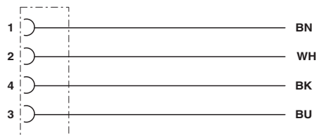
Contact assignment of the M12 socket